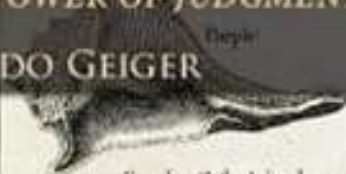
Conch with the Animal